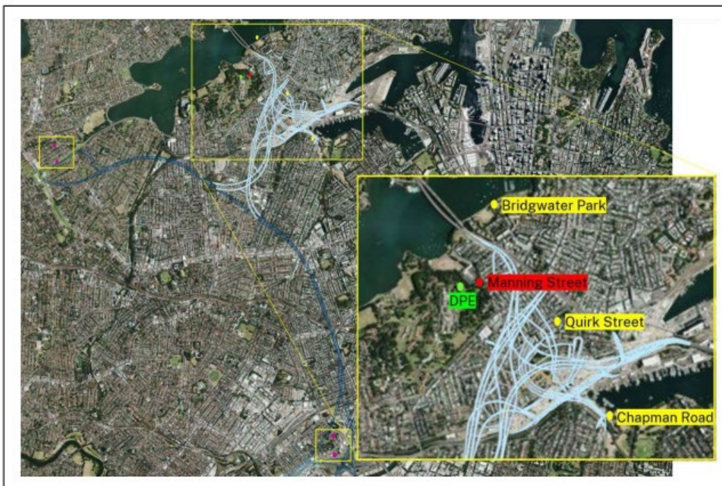
Figure 1 | Location of ambient air quality monitoring stations